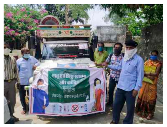
An audio awareness campaign in Jhadol block